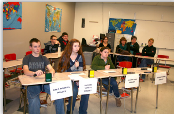
Academic Challenge Bowl participants

Holley has two chess teams, A and B, because of so much student interest. In the first match for Team A, they won against Kendall. In the remaining three matches for Team B, they lost against Albion High School, Brockport and Albion Middle School.