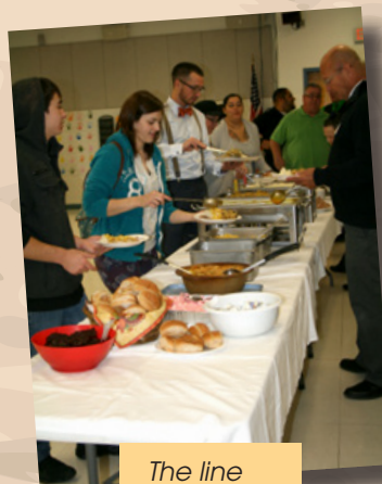
The line for food

The students in the Alt High program are ones who aren’t as successful in the structure of traditional high school and benefit from smaller classes and more individual attention. Some of the students transition to attending Holley MS/HS for part of the day or attend Monroe 2–Orleans BOCES Career and Technical Education for half a day and then spend the rest of their day at the Alt High, which is housed in the Holley Elementary School building. When the students graduate from the Alt High program, many of them attend community college, join the military or accept employment. The students learn to create their own definitions of success and become independent. A lot of them enjoyed the opportunity to showcase their culinary skills at the Thanksgiving Feast.